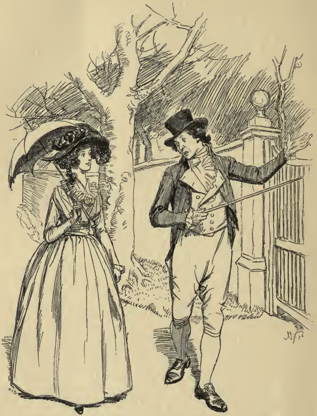
'Everything in such respectable condition.'